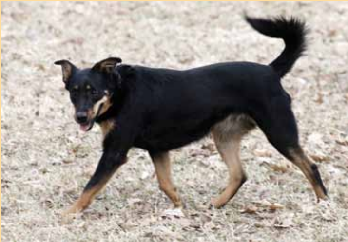
Cahokia could not run, let alone stand, one year ago. Now she runs and plays with other companions in her forever home.