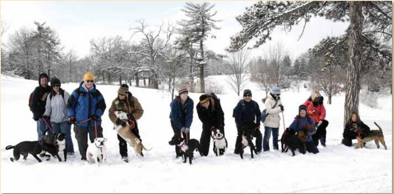
An early morning snowstorm only added to the enjoyment of the group's "Couples Hike" Feb. 5 in Forest Park for dogs at the Pine Street shelter.

Over hill, over dale, they love to hit the dusty – or snow-packed – trail. Group hikes, Stray Rescue's newest activity, quickly is gaining popularity not only among the dogs, but also with the volunteers.