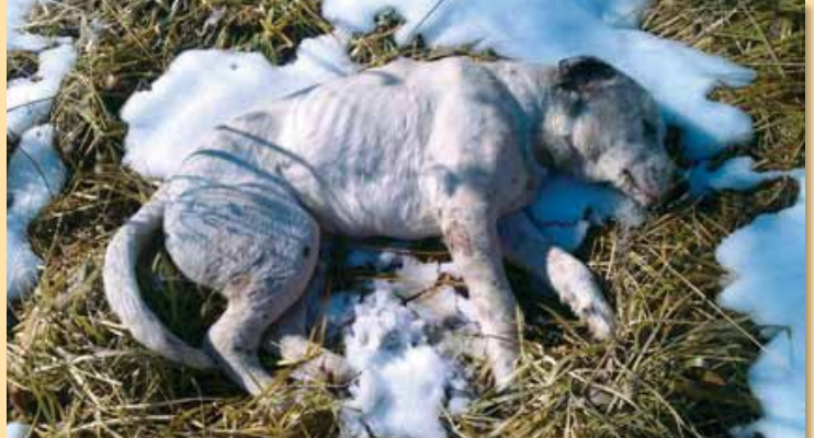
Stracks lies near death on the street.

Stracks, you are loved by many and have touched us all.