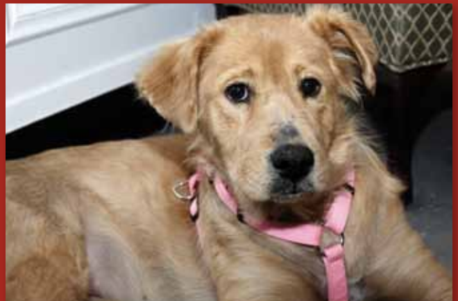
Grace - After