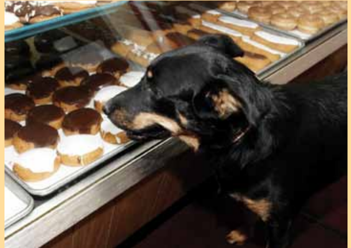
Visiting a donut shop in South St. Louis for sweet treats to reward Cahokia for hard work in therapy sessions.

In our Spring 2010 Newsletter, we introduced you to Cahokia, a Shepherd mix who had survived being hit by a car only to contract the distemper virus, which is a death sentence for virtually every dog.