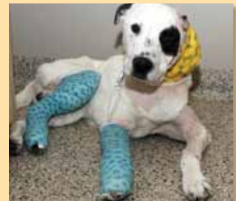
Stracks begins his road to recovery.