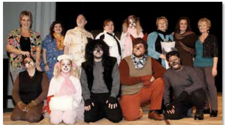
The cast and crew of Barkaritaville are all smiles at the conclusion of the performance.