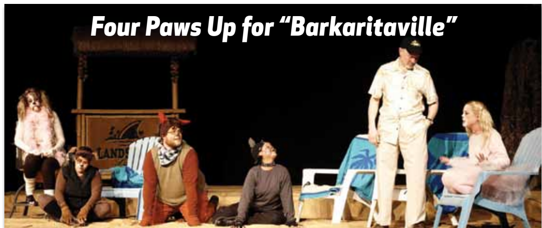
"Wasting Away in Barkaritaville" played to a sold-out house at the Stray Dog Theatre in January.