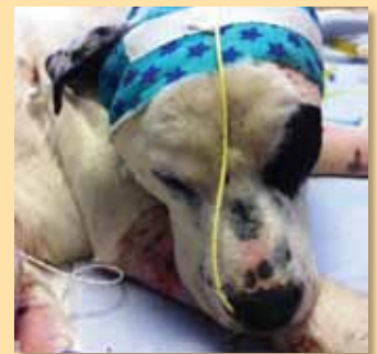
Stracks immediately after surgery.