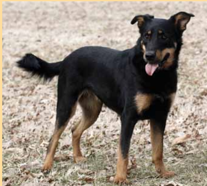
Cahokia is another of Stray Rescue's Miracle Dogs.